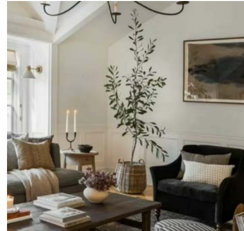
Mood board image